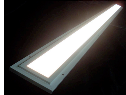
• Frame Finish : Aluminum, White Painting